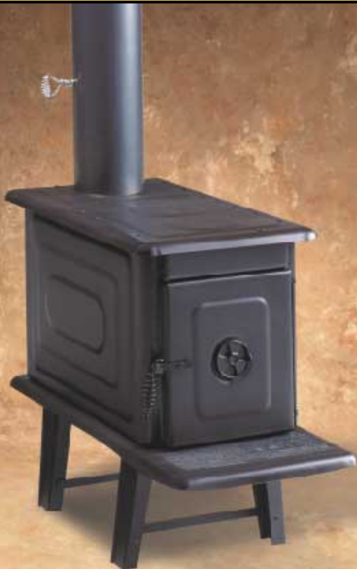
BOXWOOD RANCH STOVE - MODEL 127